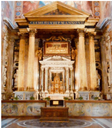
The Lateran Basilica in Rome

Saint Michael the Archangel Basilica 12 Howard Street, Miramichi Saint Michael's by-the-Sea 7321 NB-117, Miramichi Bay Saint Margaret's Church 9371 NB-11, Saint Margarets