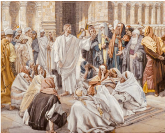
Pharisees Question Jesus, by James Tissot

Saint Margaret's Church 9371 NB-11, Saint Margarets