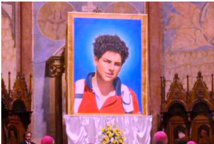
Blessed Carlo Acutis, the first millennial saint, to be canonized April 27, 2025

Saint Michael the Archangel Basilica 12 Howard Street, Miramichi Saint Michael's by-the-Sea 7321 NB-117, Miramichi Bay Saint Margaret's Church 9371 NB-11, Saint Margarets