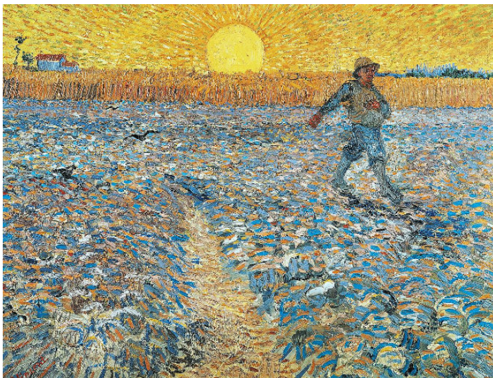
The Sower , by Vincent van Gogh

Saint Margaret's Church 9371 NB-11, Saint Margarets