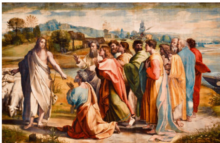
Christ's Charge to Peter, by Raphael Third Sunday of Easter

Saint Michael the Archangel Basilica 12 Howard Street, Miramichi Saint Michael's by-the-Sea 7321 NB-117, Miramichi Bay Saint Margaret's Church 9371 NB-11, Saint Margarets