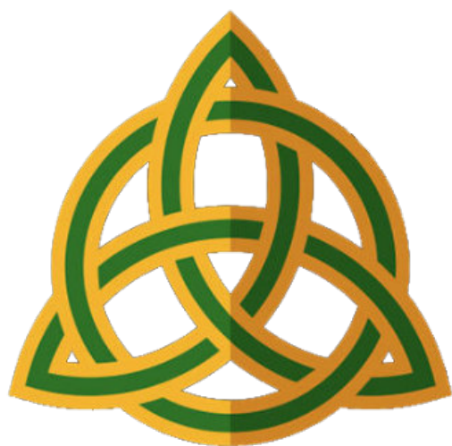
Celtic Trinity Knot

Saint Margaret's Church 9371 NB-11, Saint Margarets