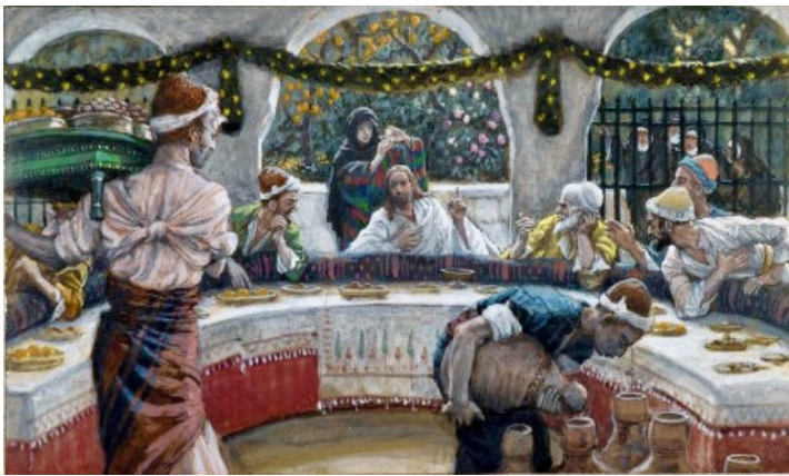
The Meal in the House of the Pharisee, by Tissot

Saint Margaret's Church 9371 NB-11, Saint Margarets