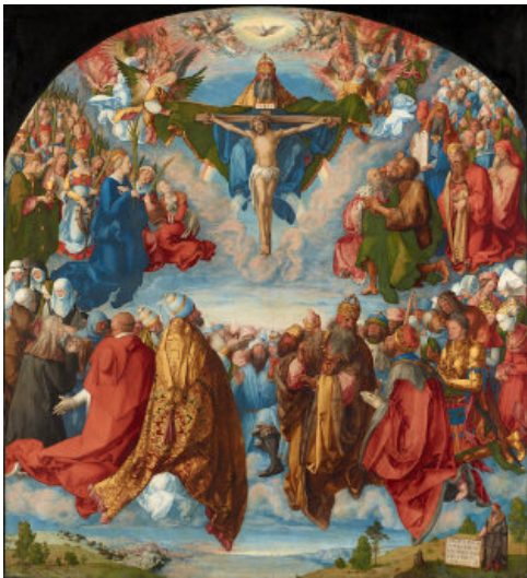
Adoration of the Trinity, by Albrecht Dürer

Saint Michael the Archangel Basilica 12 Howard Street, Miramichi Saint Michael's by-the-Sea 7321 NB-117, Miramichi Bay Saint Margaret's Church 9371 NB-11, Saint Margarets