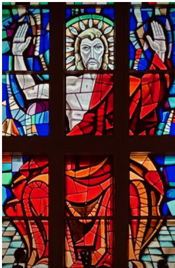
Christ Pantocrator, stained glass above the choir loft of Saint Michael's Basilica

Saint Margaret's Church 9371 NB-11, Saint Margarets