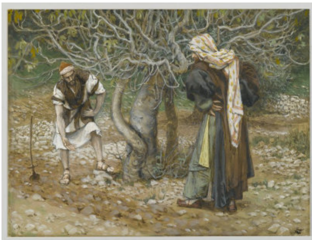
The Vine Dresser and the Fig Tree, by Tissot

Saint Margaret's Church 9371 NB-11, Saint Margarets