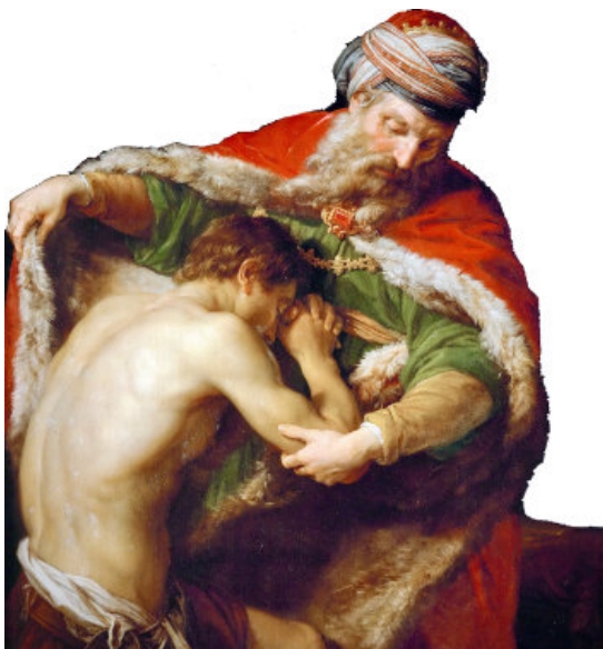
Return of the Prodigal Son, by Pompeo Batoni

Saint Michael the Archangel Basilica 12 Howard Street, Miramichi Saint Michael's by-the-Sea 7321 NB-117, Miramichi Bay Saint Margaret's Church 9371 NB-11, Saint Margarets