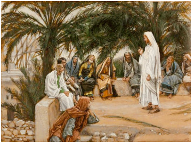
The Last shall be First, by James Tissot

Saint Michael the Archangel Basilica 12 Howard Street, Miramichi Saint Michael's by-the-Sea 7321 NB-117, Miramichi Bay Saint Margaret's Church 9371 NB-11, Saint Margarets