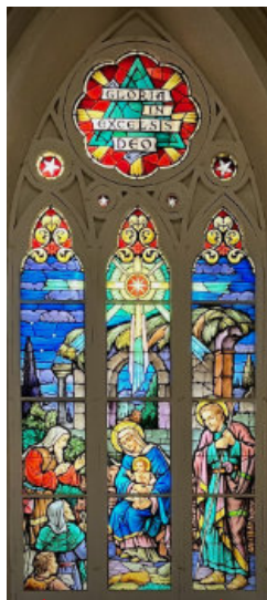
The Nativity Scene - stained glass in the Basilica of Saint Michael the Archangel

Saint Michael the Archangel Basilica 12 Howard Street, Miramichi Saint Michael's by-the-Sea 7321 NB-117, Miramichi Bay Saint Margaret's Church 9371 NB-11, Saint Margarets