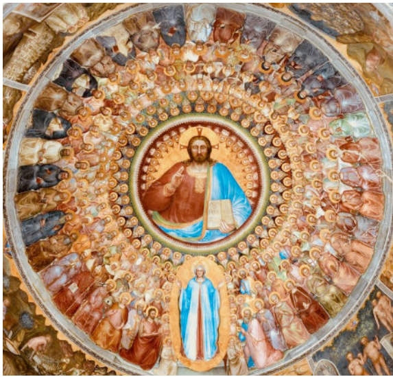
Communion of Saints - Dome Fresco in the Padua Baptistery

Saint Margaret's Church 9371 NB-11, Saint Margarets