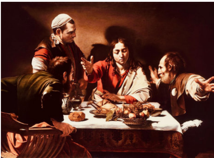
Supper at Emmaus , by Caravaggio

Saint Michael the Archangel Basilica 12 Howard Street, Miramichi Saint Michael's by-the-Sea 7321 NB-117, Miramichi Bay Saint Margaret's Church 9371 NB-11, Saint Margarets