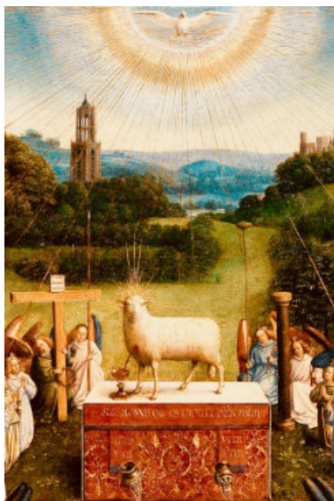
The Lamb of God detail from van Eyck's Ghent Altarpiece

Saint Margaret's Church 9371 NB-11, Saint Margarets