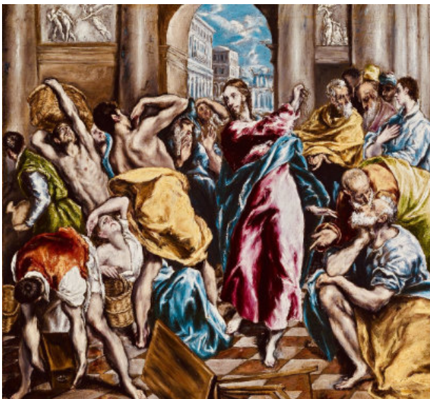
The Purification of the Temple, by El Greco

Saint Margaret's Church 9371 NB-11, Saint Margarets