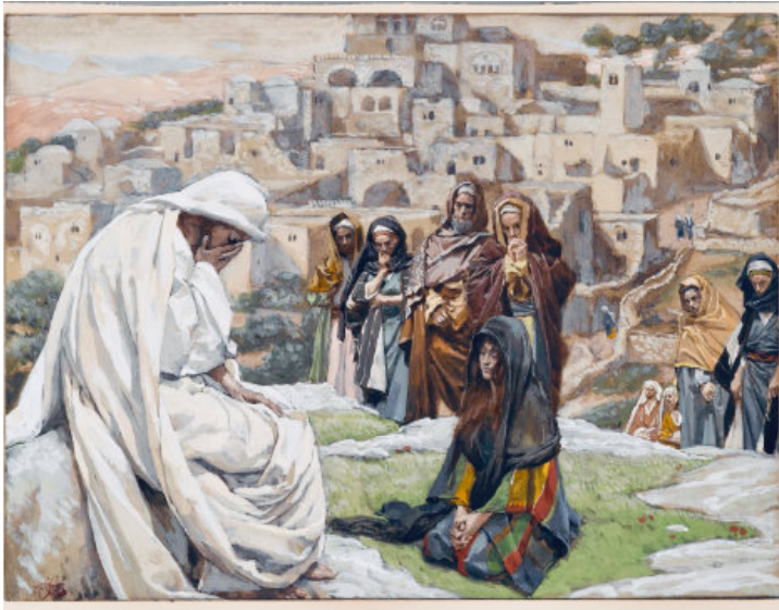
'Blessed are they that mourn...' Jesus Wept , by Tissot.

Saint Michael the Archangel Basilica 12 Howard Street, Miramichi Saint Michael's by-the-Sea 7321 NB-117, Miramichi Bay Saint Margaret's Church 9371 NB-11, Saint Margarets