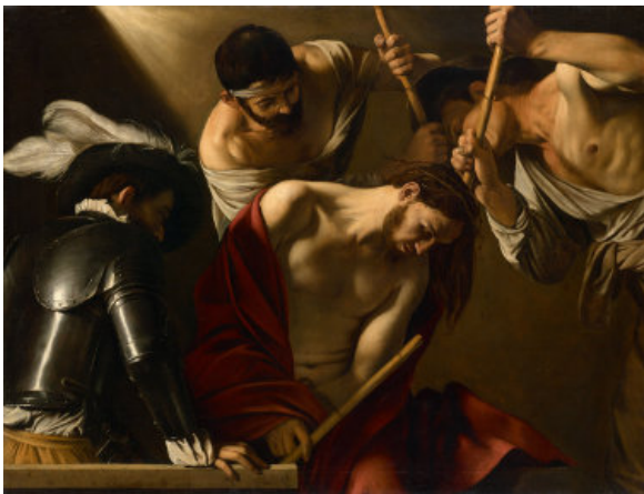
The Crowning with Thorns, by Caravaggio

Saint Michael the Archangel Basilica 12 Howard Street, Miramichi Saint Michael's by-the-Sea 7321 NB-117, Miramichi Bay Saint Margaret's Church 9371 NB-11, Saint Margarets