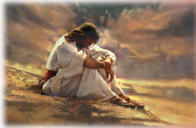
Jesus was "tempted by Satan"