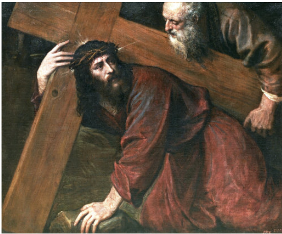
Christ on the Way to Calvary, by Titian

Saint Margaret's Church 9371 NB-11, Saint Margarets