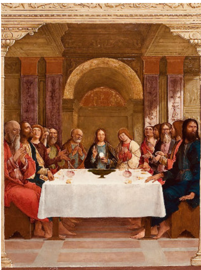
The Institution of the Eucharist by Ercole de Roberti

Saint Margaret's Church 9371 NB-11, Saint Margarets