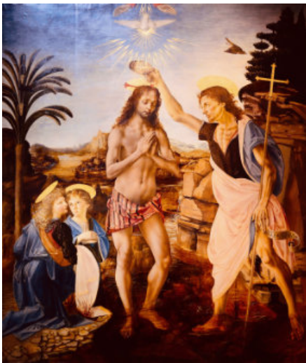
The Baptism of Christ, painting by Andrea del Verrocchio and Leonardo da Vinci Baptism of the Lord

Saint Michael the Archangel Basilica 12 Howard Street, Miramichi Saint Michael's by-the-Sea 7321 NB-117, Miramichi Bay Saint Margaret's Church 9371 NB-11, Saint Margarets