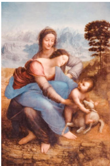
The Virgin Mother Mary and child Jesus with Saint Anne, by Leonardo da Vinci

Saint Michael the Archangel Basilica 12 Howard Street, Miramichi Saint Michael's by-the-Sea 7321 NB-117, Miramichi Bay Saint Margaret's Church 9371 NB-11, Saint Margarets