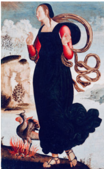
The Theological Virtue of Hope, by an Umbrian painter

Saint Margaret's Church 9371 NB-11, Saint Margarets